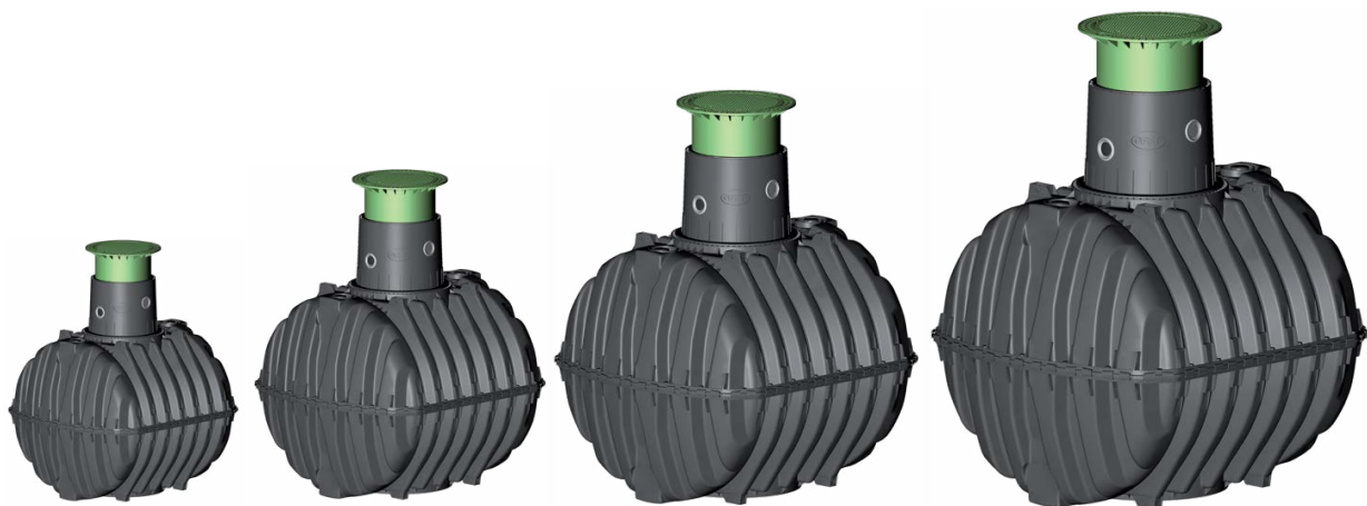
FIG. 2 Recommend tall turret for all applications