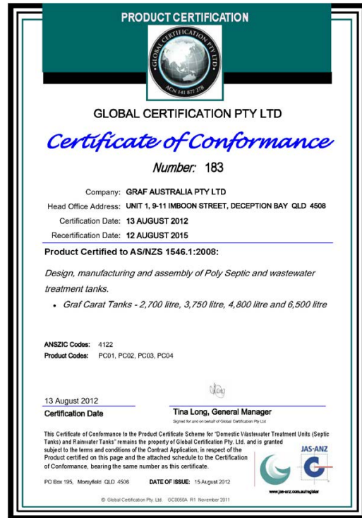
FIG. 1 Graf Product Certificate 1546.1