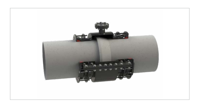
FIG. 1 Duo-Fit coupler installed on a concrete pipe