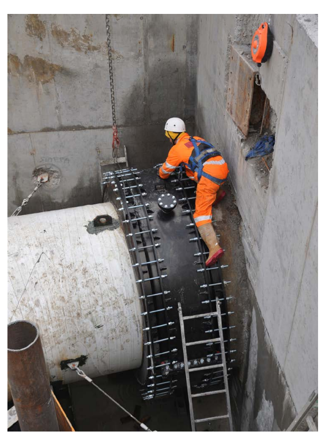
FIG. 2 FIG. 3