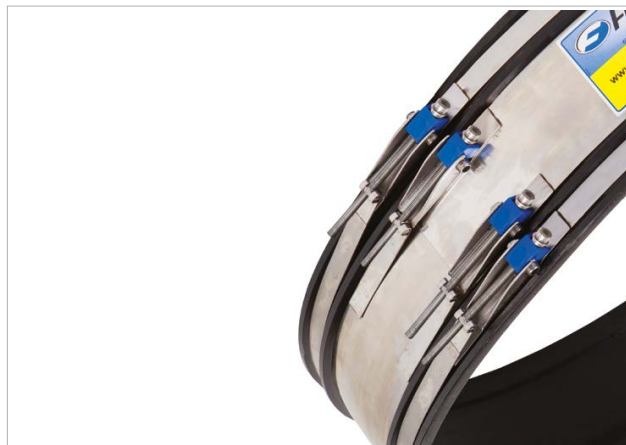
FIG. 1 Flexseal Large Coupling bolting system