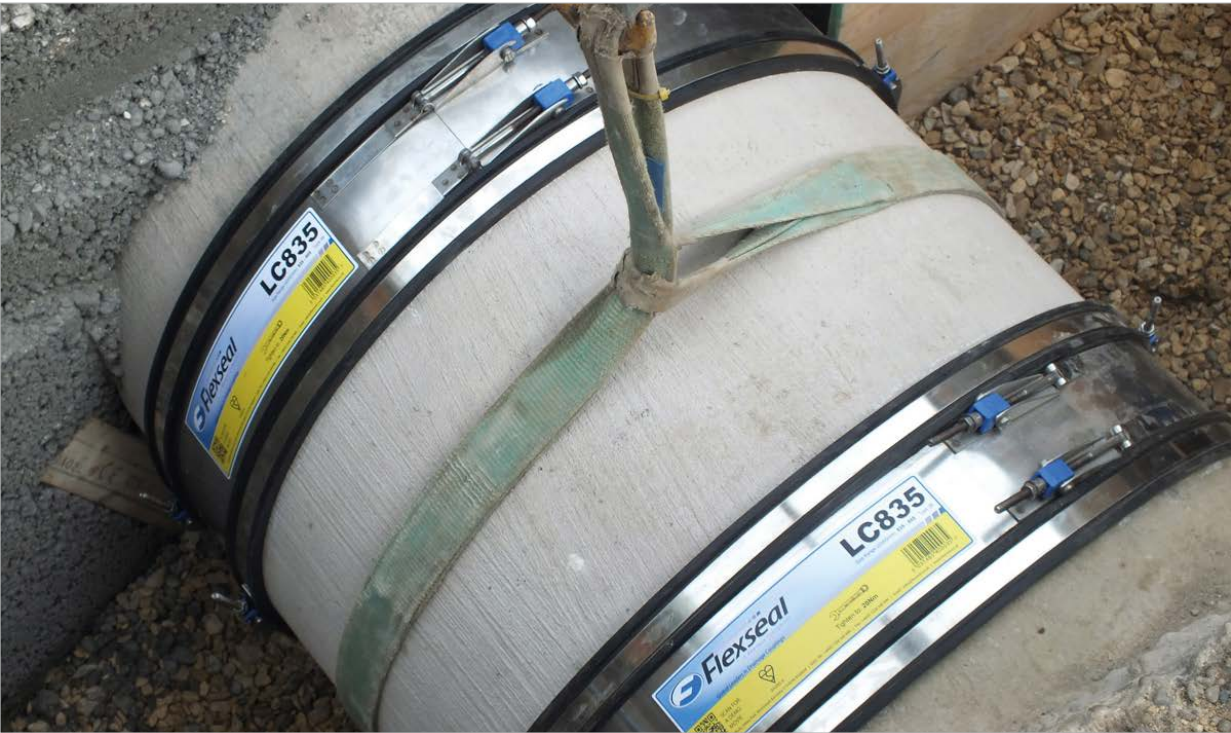
FIG. 2 Flexseal Large Coupling insitu installation

Bushes: Slide the bush over pipe prior to the coupler – it should fit tightly. In some cases, lube may be required. Fit the couplers on the large pipe as above.