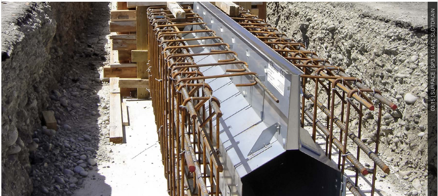
03.15 | SURFACE | SP3.1 GATIC SLOTDRAIN

A tough, unobtrusive, low profile surface drainage system capable of handling large hydraulic volumes.