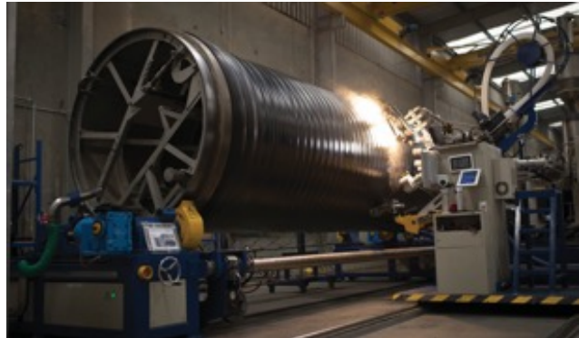
FIG. 1 Supaduct® Rural manufacturing process.