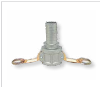
FIG. 1 Female Coupler to Hose Tail