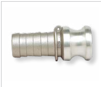
FIG. 2 Male Adaptor to Hose Tail