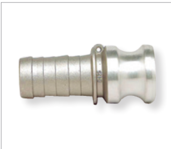
FIG. 2 Male Adaptor to Hose Tail