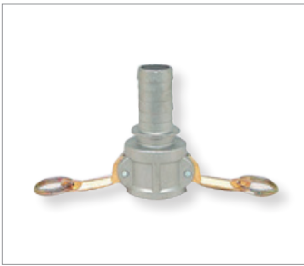
FIG. 1 Female Coupler to Hose Tail