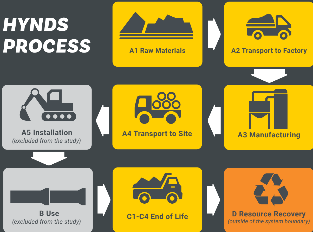
Diagram of Hynds process