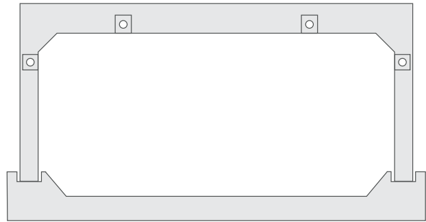
FIG. 1 Width and height diagram for Table 1