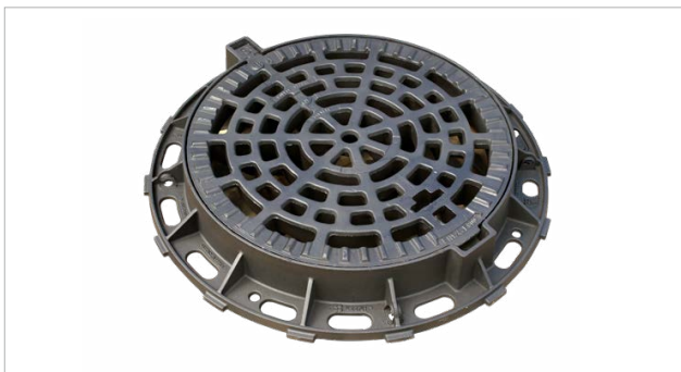
FIG. 4 Stock code GATIC-320G6G 600 mm Sump Grate Hinged Class F/G