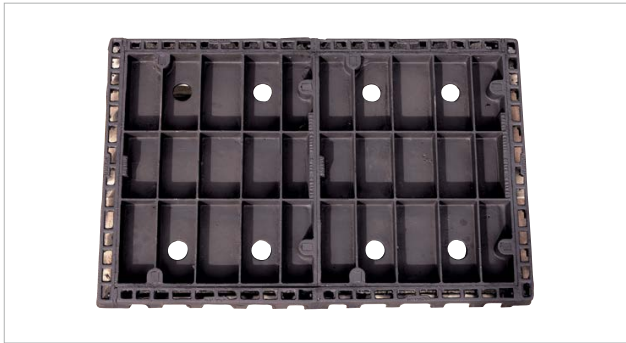
FIG. 1 Stock code GATIC-02301122 600 x 1270 mm - 2 Part Class D