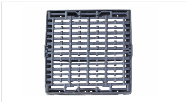
FIG. 3 Stock code GATIC-321S66D 600 x 600 mm Sump Grate Class D