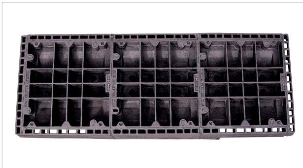
FIG. 2 Stock code GATIC-02302195 600 x 2000 mm - 3 Part Class F/G