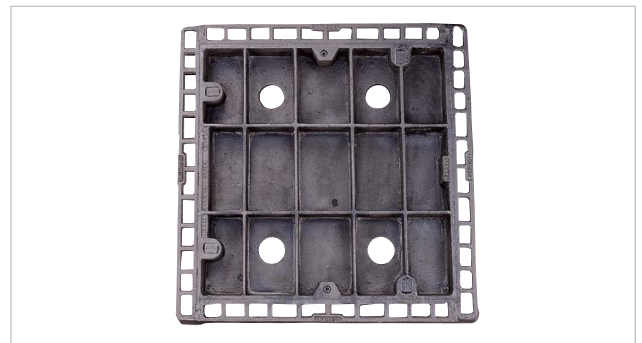
FIG. 7 Stock code GATIC-301C66D 600 x 600 mm Infilled Class D