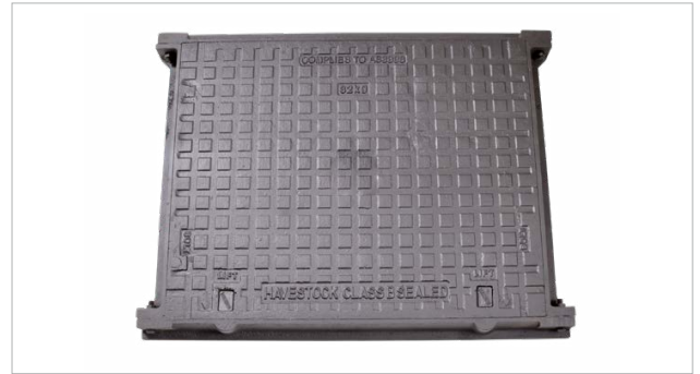
FIG. 5 Stock code GATIC-2301084.1 600 x 475mm Solid Top Class B