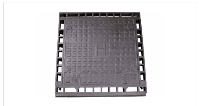
FIG. 8 Stock code GATIC-02301093 600 x 600 mm Solid Top Class D