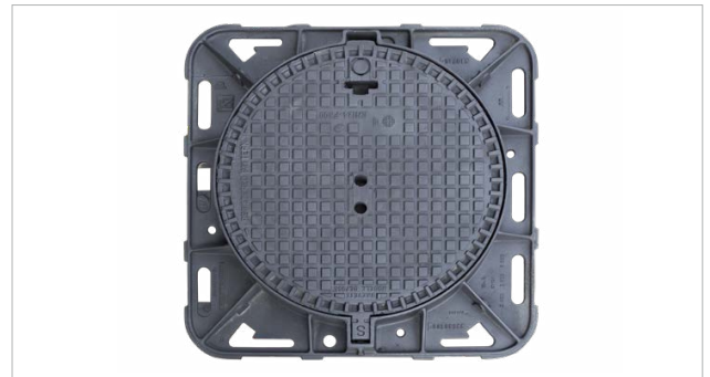
FIG. 6 Stock code GATIC-300S5G 600 mm Solid Top Hinged Class F/G