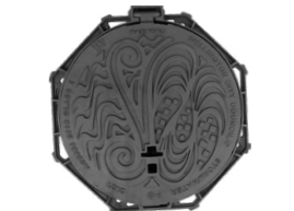
FIG. 4 DIMHMCFHSSTWWCC