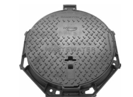
FIG. 9 DIMHMCFHSWTWCCC