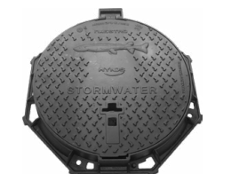
FIG. 8 DIMHMCFHSSTWCCC