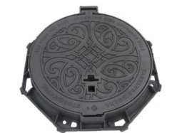
FIG. 2 DIMHMCFTCCSTW