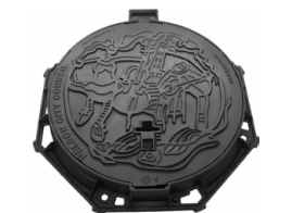
FIG. 6 DIMHMCFHSSTWNCC