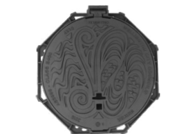
FIG. 5 DIMHMCFHSSEWWCC