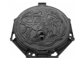
FIG. 7 DIMHMCFHSWTWNCC