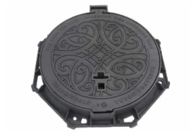
FIG. 3 DIMHMCFTCCWW