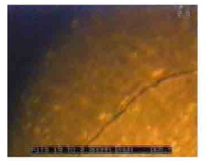
An internal circumferential crack of a DN300 concrete pipe, less than 0.5mm wide.