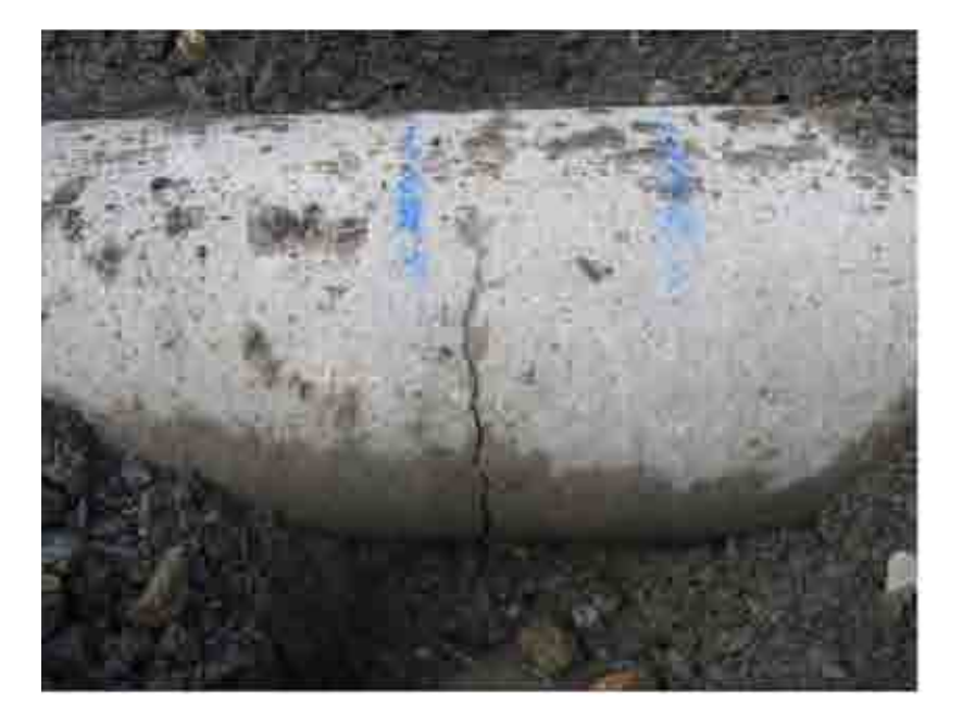
A 6mm crack at the bottom of a DN300 pipe due to stresses resulting from poor bedding.