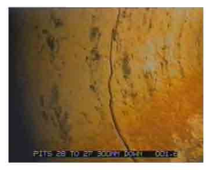
An internal circumferential crack of a DN300 concrete pipe, greater than 0.5mm wide.