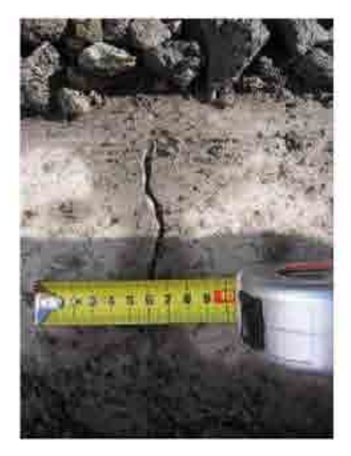
A 6mm crack at the top of a DN300 pipe due to stresses that have resulted from poor bedding