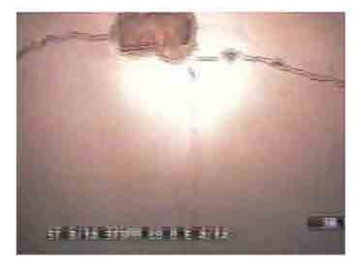
An internal circumferential crack of a DN375 concrete pipe, greater than 0.5mm wide.