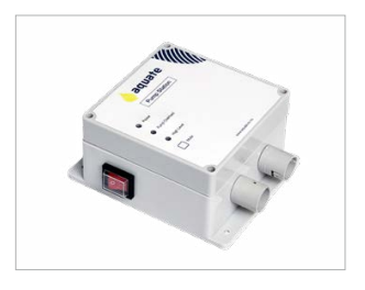
FIG. 2 Controller – manufactured to AS/NZS 3000:2007

For larger systems, additional features can be included if required.