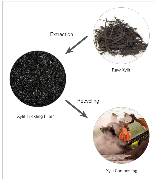
FIG. 1 Xylit

The natural properties of the Xylit maintains biological activity for long periods without intervention. The unique potential of the Xylit makes the X-Perco a dependable choice for sustainable wastewater treatment.