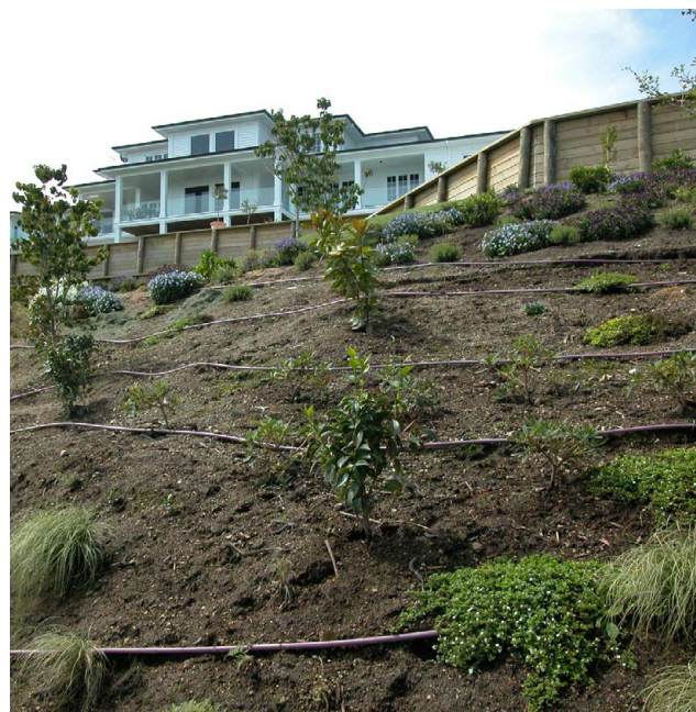
FIG. 2 Drip irrigation pipe prior to bark being laid.