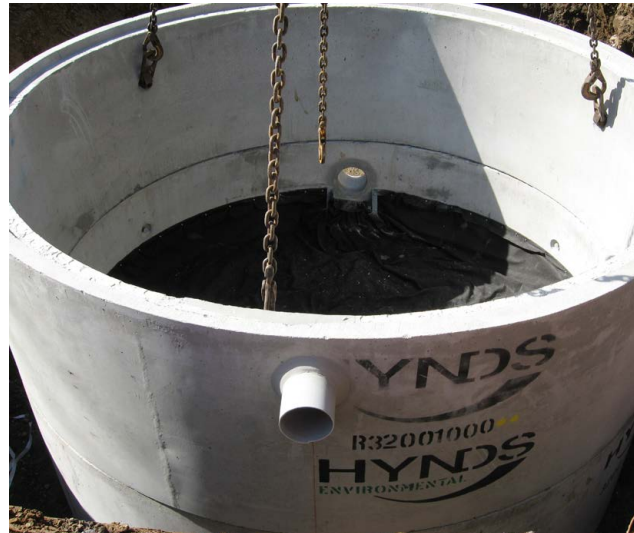
FIG. 1 Sand Filter – filtration chamber installation.

Note: Sand is placed after system installation.