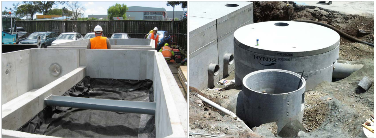
FIG. 3 Sedimentation and filtration chamber