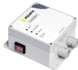
FIG. 1 Controller – manufactured to AS/NZS 3000:2007

For larger systems, additional features can be included if required.