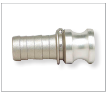
FIG. 2 Male Adaptor to Hose Tail