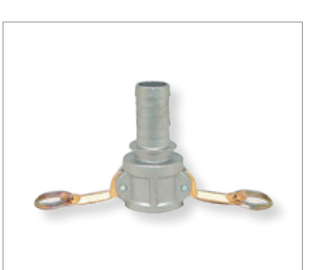
FIG. 1 Female Coupler to Hose Tail