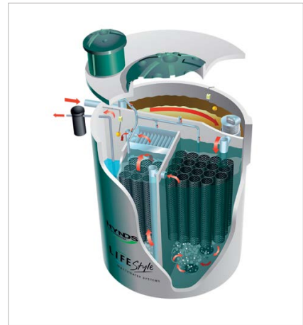
FIG. 2 Hynds Lifestyle Ultimate