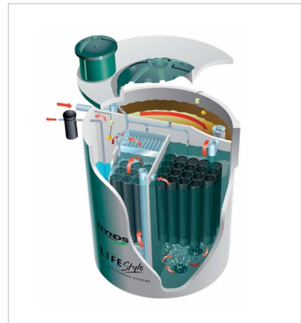
FIG. 1 Hynds Lifestyle Advanced