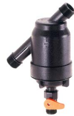
FIG. 4 Irrigation filter IRRA25TFC130 (body) IRRA25TFCL130 (disk)