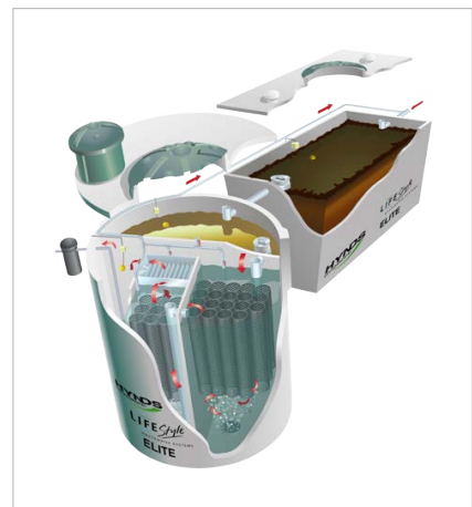
FIG. 3 Hynds Lifestyle Elite