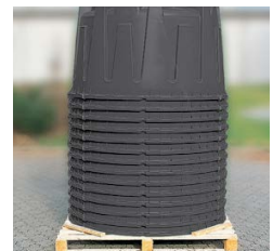
FIG. 4 Stackable Easy to transport. Up to 10 chambers per pallet.

Branches Nationwide Support Office & Technical Services 09 274 0316