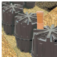
FIG. 2 Extendable Shape-matched end connectors and connection surfaces enable volumes of several 10000 ltrs