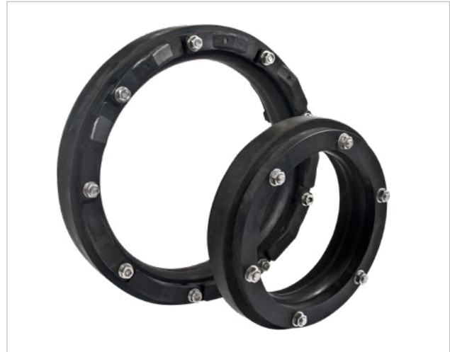
FIG. 1 Linked Seal, Standard Seal