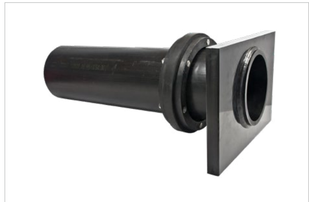
FIG. 2 Optional Flanged PE manhole connector and standard seal