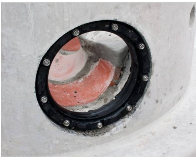
FIG. 3 Hyseal ready to connect pipe