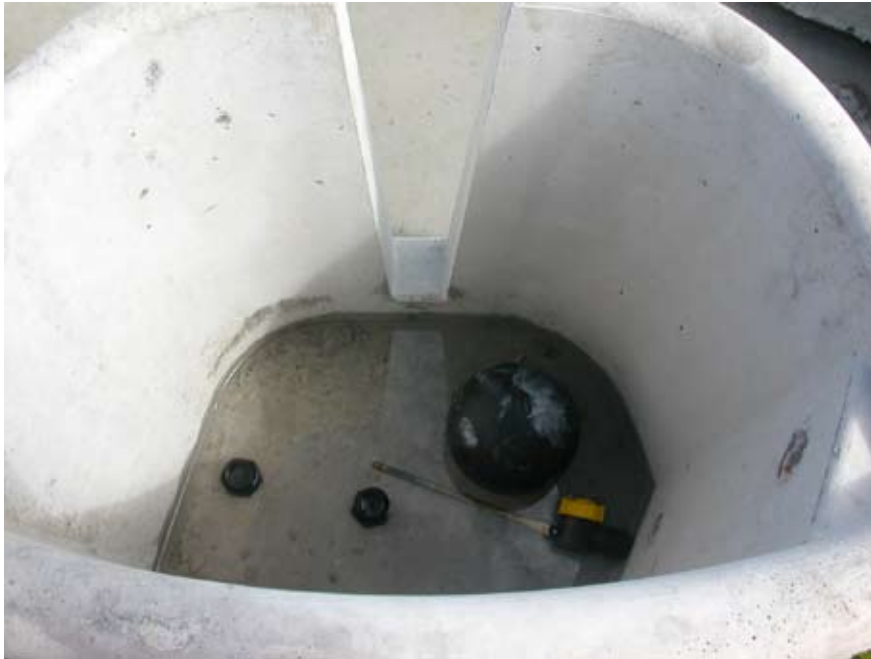
TR200SI & TR350SI