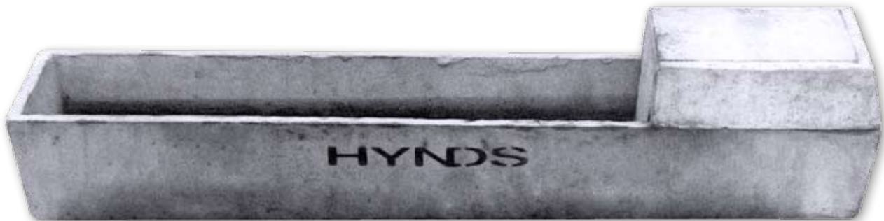
TPIGLMC + TPIGCMC