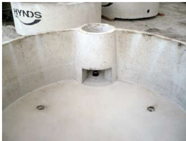
TC200WVPV, TC350WVPV – Valve chamber set up